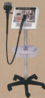
The G5 System of Medical Massage